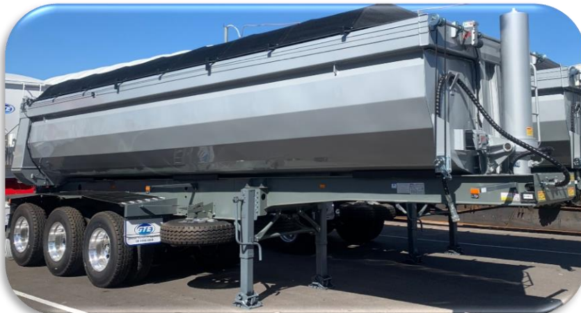
ELECTRIC BACK TO FRONT TARP STANDARD

Cnr McDowell St & Abernethy Road, Kewdale, W.A. Phone (08) 9352 4000 Email: gte@gtetrailers.com.au