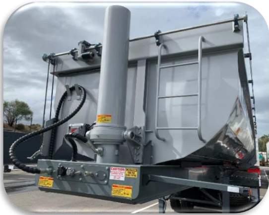
HYVA LIFTING CYLINDER