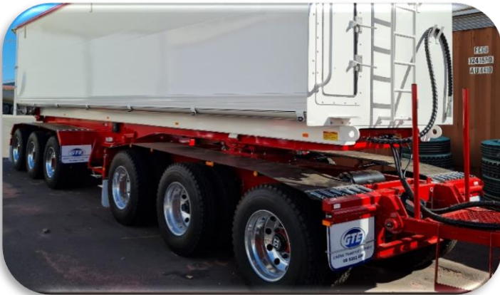
DOLLY WITH GRAIN TIPPER