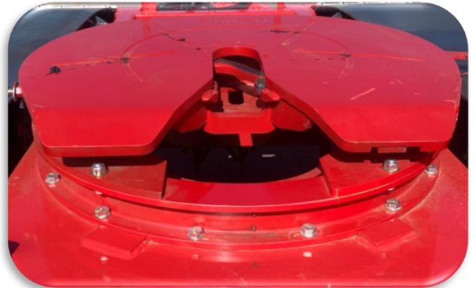
TURNTABLE AND BALLRACE